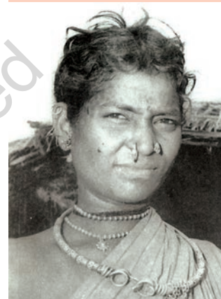
Fig. 5 A Gond woman.

The administrative system of these kingdoms was becoming centralised. The kingdom was divided into