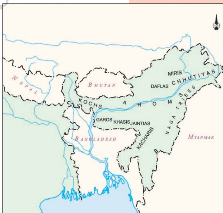
Map 3 Tribes of eastern India.

Discuss why the Mughals were interested in the land of the Gonds.