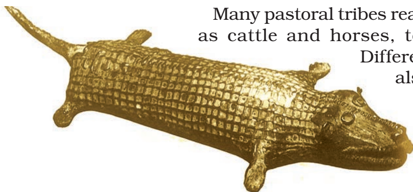
Fig. 4 Bronze crocodile, Kutiya Kond tribe, Orissa.

Many pastoral tribes reared and sold animals, such as cattle and horses, to the prosperous people.