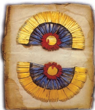
Fig. 7 Ear ornaments, Koboï Naga tribe, Manipur.