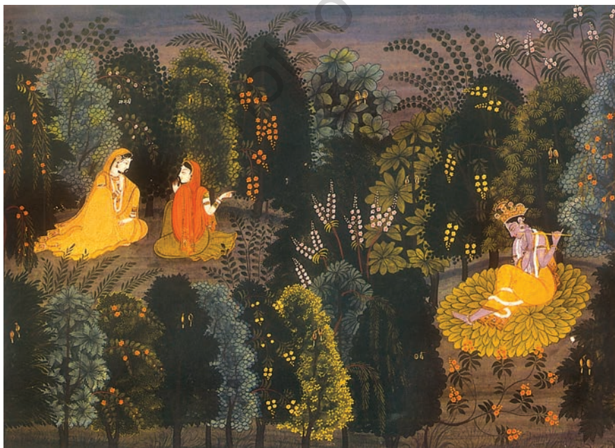
Fig. 9 Krishna, Radha and her companion, Pahari miniature, Kangra.

Pradesh. By the late seventeenth century this region had developed a bold and intense style of miniature painting called Basohli. The most popular text to be painted here was Bhanudatta's Rasamanjari . Nadir Shah's invasion and the conquest of Delhi in 1739 resulted in the migration of Mughal artists to the hills to escape the uncertainties of the plains. Here