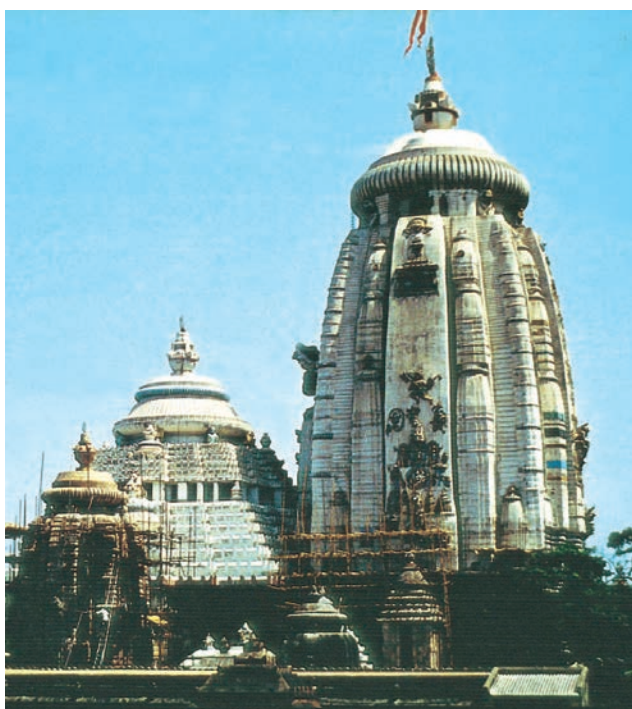
Fig. 3 Jagannatha temple, Puri.

As the temple gained in importance as a centre of pilgrimage, its authority in social and political matters also increased. All those who conquered Orissa, such as the Mughals, the Marathas and the English East India Company, attempted to gain control over the temple. They felt that this would make their rule acceptable to the local people.