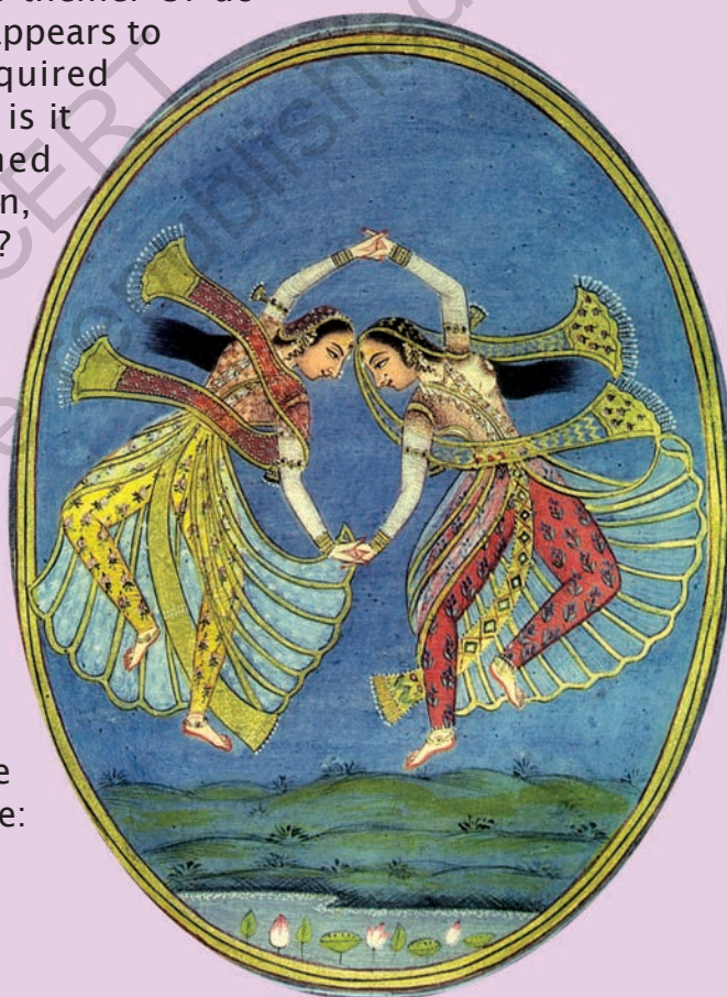
Fig. 6 Kathak dancers, a court painting.