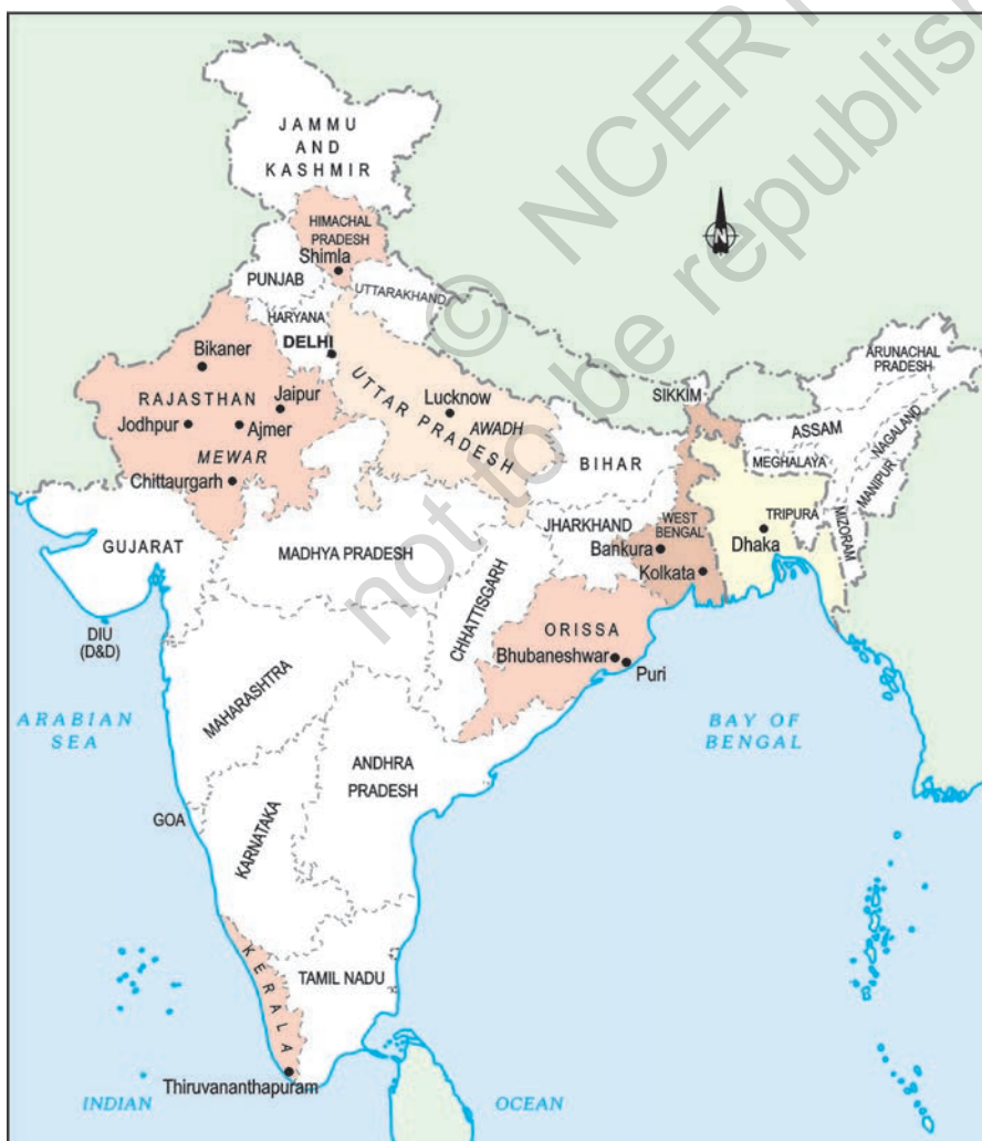
Map 1 Regions discussed in this chapter.

Did women find a place within these stories? Sometimes, they figure as the “cause” for conflicts, as men fought with one another to either “win” or “protect” women. Women are also depicted as following their heroic husbands in both life and death – there are stories about the practice of sati or the immolation of widows on the funeral pyre of their husbands. So those