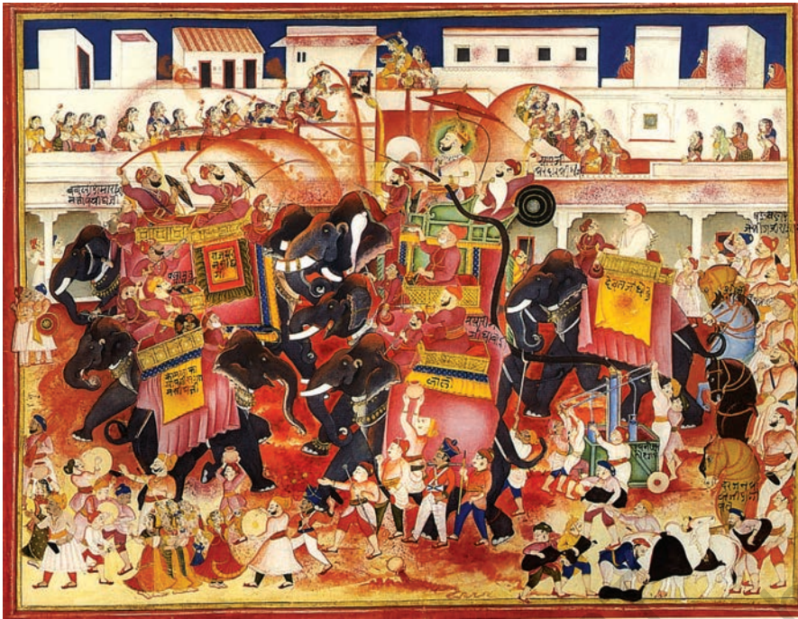
Fig. 8 Maharana Ram Singh II playing holi. Rajput miniature, Kota.

Pradesh. By the late seventeenth century this region had developed a bold and intense style of miniature painting called Basohli. The most popular text to be painted here was Bhanudatta's Rasamanjari . Nadir Shah's invasion and the conquest of Delhi in 1739 resulted in the migration of Mughal artists to the hills to escape the uncertainties of the plains. Here