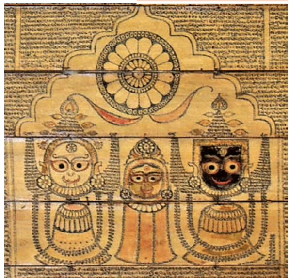
Fig. 2 The icons of Balabhadra, Subhadra and Jagannatha, palm-leaf manuscript, Orissa.

In the twelfth century, one of the most important rulers of the Ganga dynasty, Anantavarman, decided to erect a temple for Purushottama Jagannatha at Puri. Subsequently, in 1230, king Anangabhima III dedicated his kingdom to the deity and proclaimed himself as the “deputy” of the god.