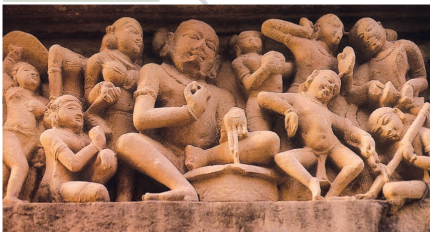
Fig. 5 Dance class, Lakshmana temple, Khajuraho.

who followed the heroic ideal often had to pay for it with their lives.