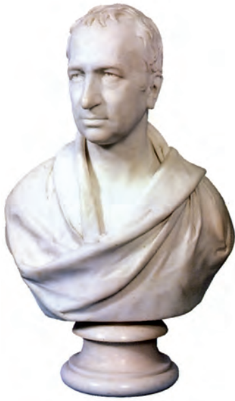
Fig. 2 – Henry Thomas Colebrooke

He was a scholar of Sanskrit and ancient sacred writings of Hinduism.