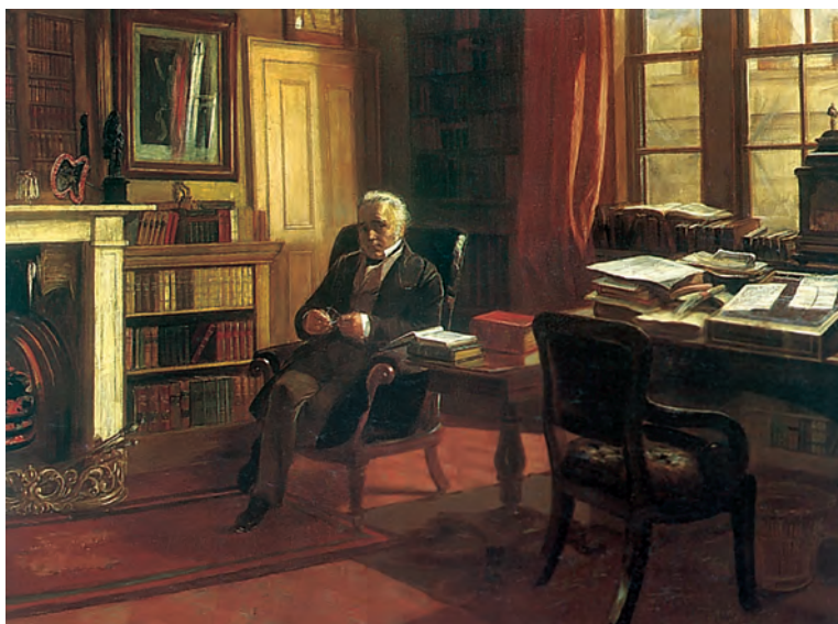
Fig. 4 – Thomas Babington Macaulay in his study