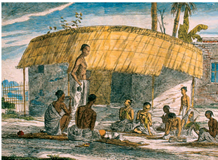
Fig. 8 – A village pathshala This is a painting by a Dutch painter, Francois Solvyn, who came to India in the late eighteenth century. He tried to depict the everyday life of people in his paintings.

Adam discovered that this flexible system was suited to local needs. For instance, classes were not held during harvest time when rural children often worked in the fields. The pathshala started once again when the crops had been cut and stored. This meant that even children of peasant families could study.