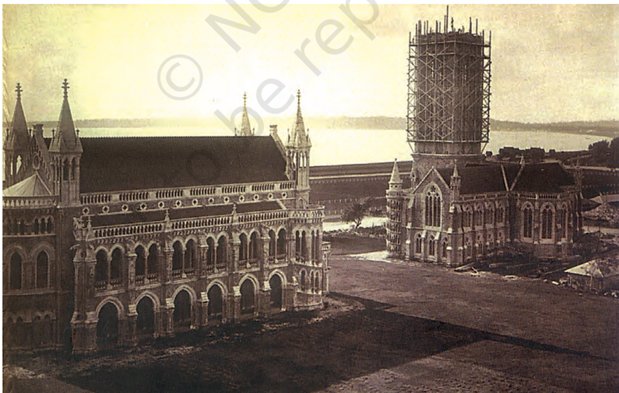
Fig. 5 – Bombay University in the nineteenth century

We must emphatically declare that the education which we desire to see extended in India is that which has for its object the diffusion of the improved arts, services, philosophy, and literature of Europe, in short, European knowledge.