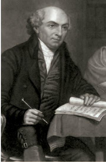
Fig. 6 – William Carey was a Scottish missionary who helped establish the Serampore Mission

The argument for practical education was strongly criticised by the Christian missionaries in India in the nineteenth century. The missionaries felt that education should attempt to improve the moral character of the people, and morality could be improved only through Christian education.