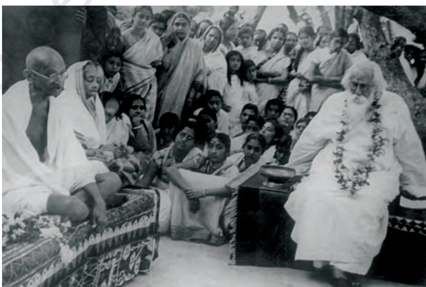
Fig. 10 – Mahatma Gandhi along with Kasturba Gandhi sitting with Rabindranath Tagore and a group of girls at Santiniketan, 1940

Western education, Mahatma Gandhi said, focused on reading and writing rather than oral knowledge; it valued textbooks rather than lived experience and practical knowledge. He argued that education ought to develop a person’s mind and soul. Literacy – or simply learning to read and write – by itself did not count as education. People had to work with their hands, learn a craft, and know how different things operated. This would develop their mind and their capacity to understand.