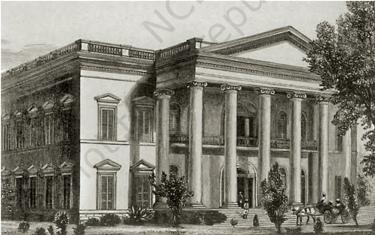
Fig. 7 – Serampore College on the banks of the river Hooghly near Calcutta

Over the nineteenth century, missionary schools were set up all over India. After 1857, however, the British government in India was reluctant to directly support missionary education. There was a feeling that any strong attack on local customs, practices, beliefs and religious ideas might enrage “native” opinion.