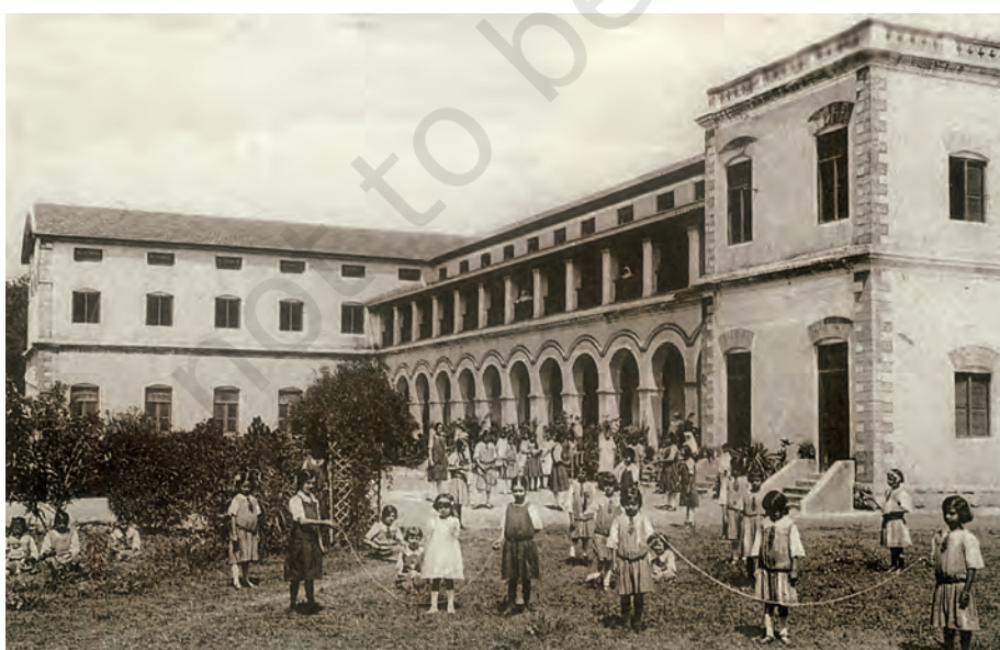
Fig. 12 – Children playing in a missionary school in Coimbatore, early twentieth century

Many individuals and thinkers were thus thinking about the way a national educational system could be fashioned. Some wanted changes within the system set up by the British, and felt that the system could be extended so as to include wider sections of people. Others urged that alternative systems be created so that people were educated into a culture that was truly national. Who was to define what was truly national? The debate about what this “national education” ought to be continued till after independence.