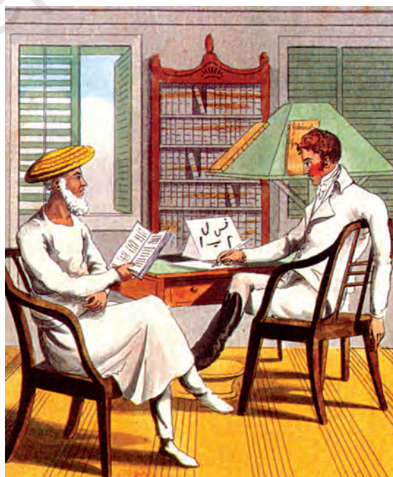
Fig. 1 – William Jones learning Persian

In 1783, a person named William Jones arrived in Calcutta. He had an appointment as a junior judge at the Supreme Court that the Company had set up. In addition to being an expert in law, Jones was a linguist . He had studied Greek and Latin at Oxford, knew French and English, had picked up Arabic from a friend, and had also learnt Persian. At Calcutta, he began spending many hours a day with pandits who taught him the subtleties of Sanskrit language, grammar and